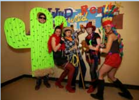
Wild, Wild Rests